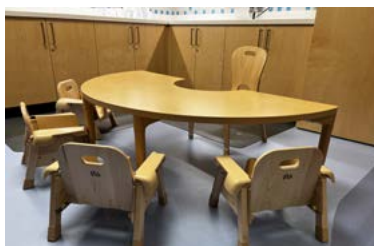
INFANT CLASSROOM: Jellyfish