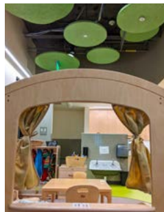
PRE-K CLASSROOM: Sea Turtles