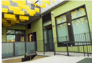
Solmar Learning Center (SLC) PLAY AREA