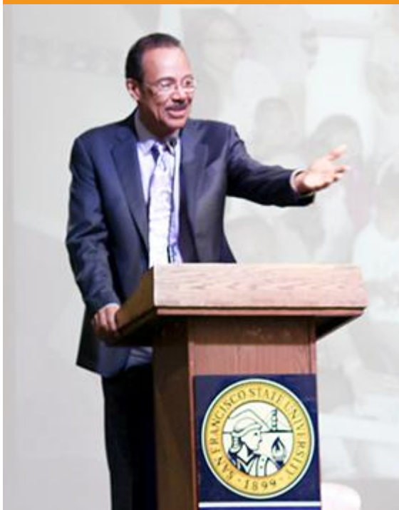
ABC7's Spencer Christian