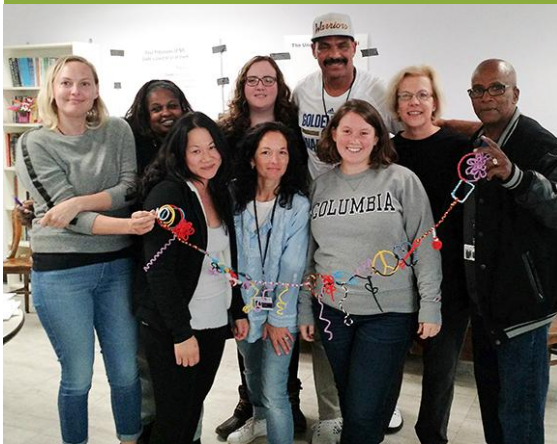
MI Training with Felton's Senior Division