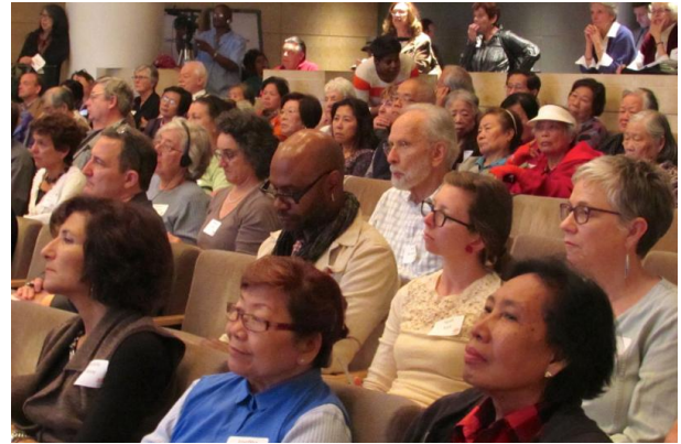
Over 300 in Audience