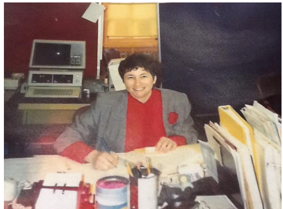
Early Years at Felton