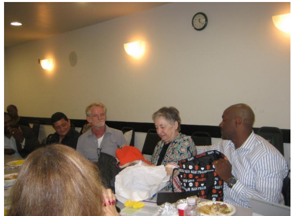
SF Giants Memorabilia