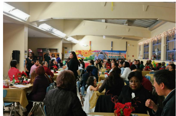
Felton Holiday Party 2014

If you haven't sent your RSVP, be sure to join us!