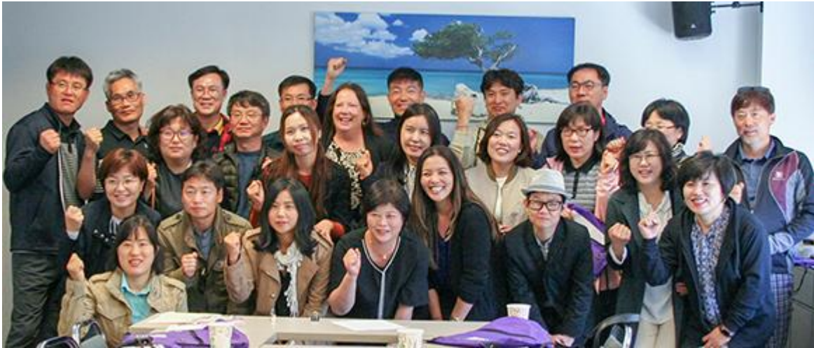
Korean delegation and Felton staff